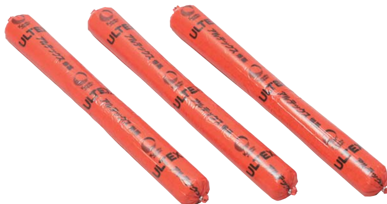
ULTEX® (poly wrapped)