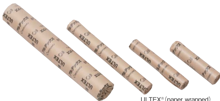
ULTEX® (paper wrapped)